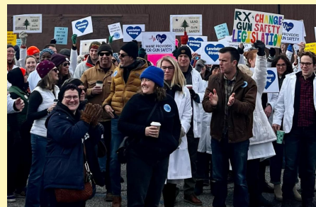
Over 200 physicians, advanced